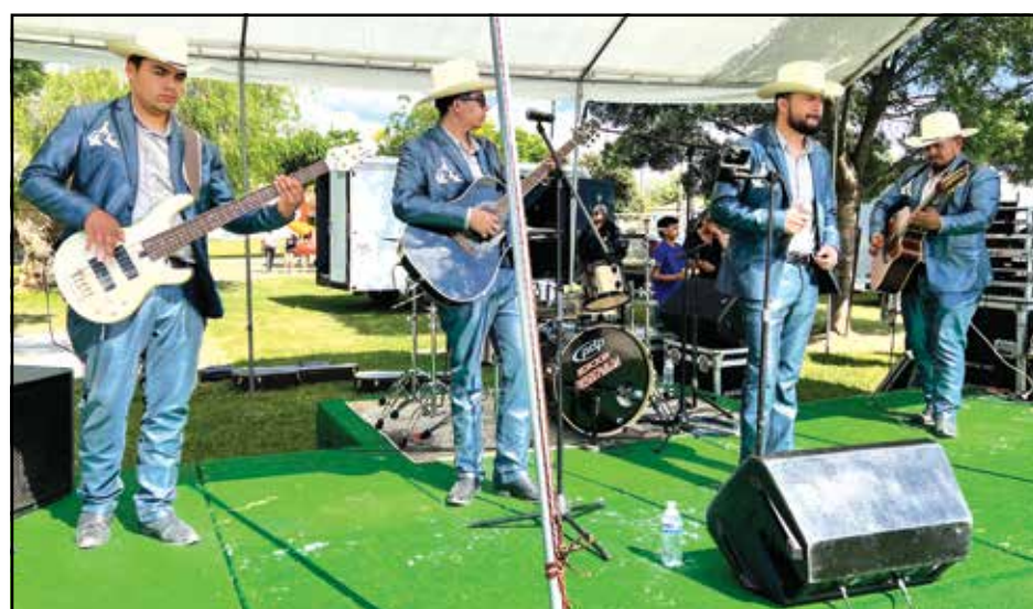
Last year's musical group was a big hit with the attendees.