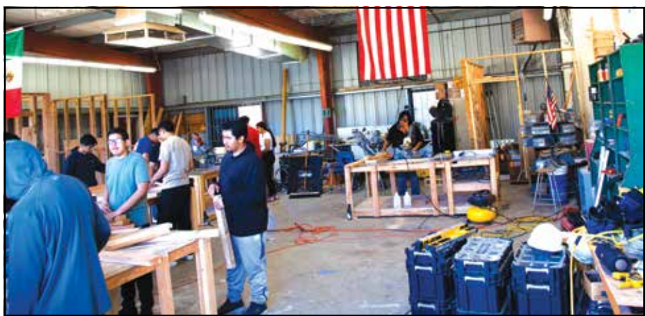
The Career Technical Education construction classroom would be modernized with funds from Measure D.