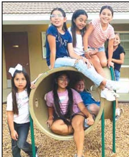
A group of girls hang out in the Kid Zone playground after their meal.

Children also develop valuable skills through their participation. "One thing they develop is their interactional skills and how to communicate with others. Some who come may be English learners and will become more confident in inter-