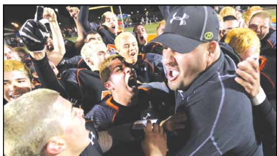
The 2012 Wasco High School Valley Championship team.