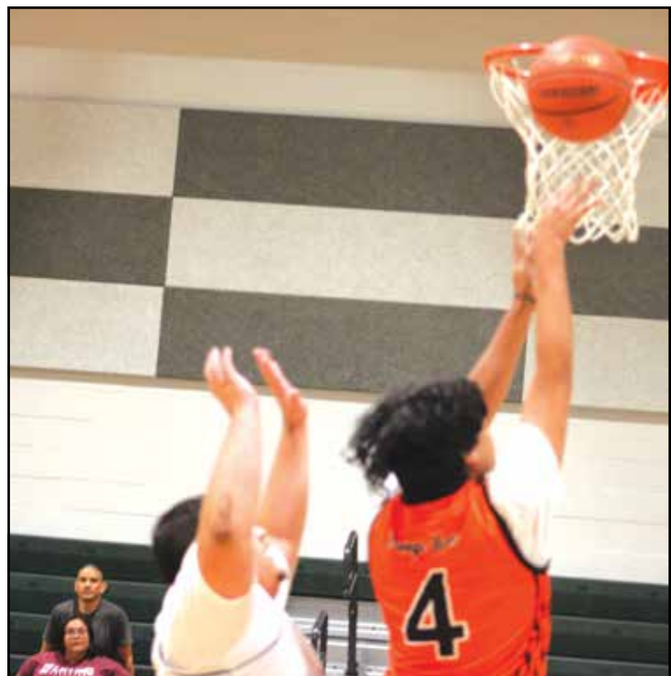
Hoop Dreams towered over the competition. RIGHT: The semifinal ended with Fuerza beating Orange Hearts by 2 points.