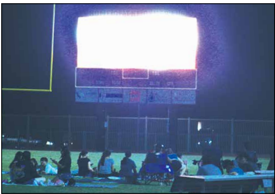
Chairs and blankets covered the grassy field. RIGHT: "Lego:Batman" was playing on the the football field's big screen.