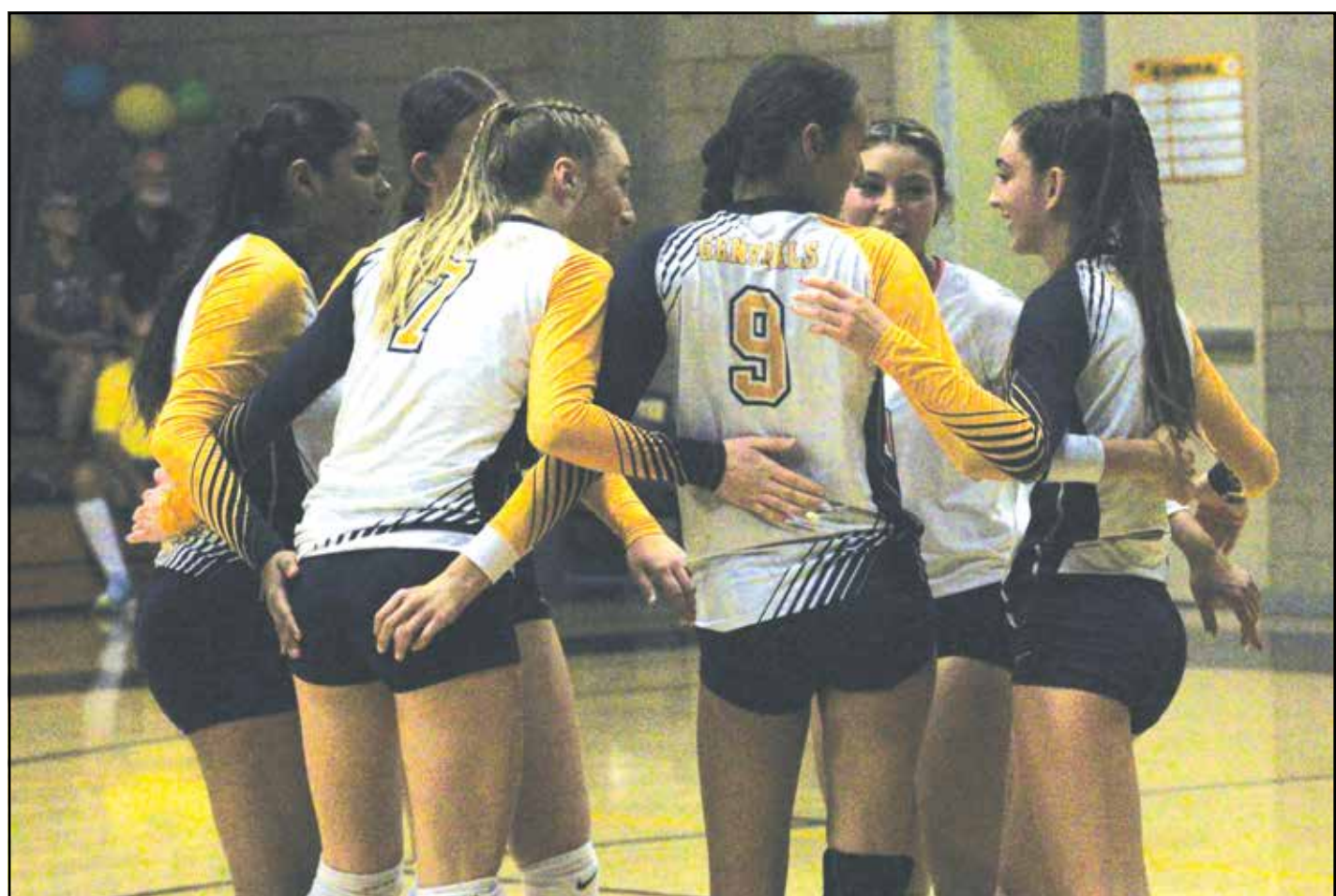
The Lady Generals in a time out just two points from match point.