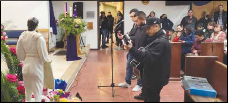
Los Amigos del Inicio, a band from Shafter, fills the church with Latin American melodies during the Feast of Our Lady of Guadalupe.