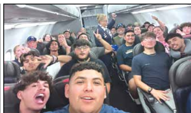
The players had the chance to go onto the grounds at Harvard's football stadium. RIGHT: Twelve of the students had never flown before.