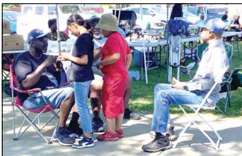
This event was for the young and old alike.

Congressman David Valadao made an appearance, along with