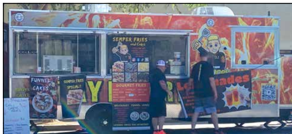
Semper Fries was one of the main attractions at Frist Friday.