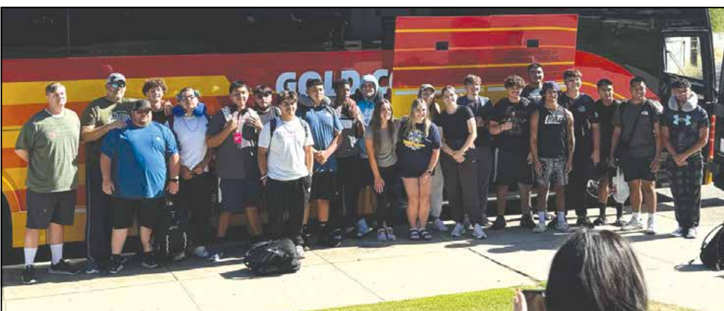
The Shafter group ready to hit the road.