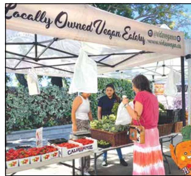
The event was full of locally grown vegetables.