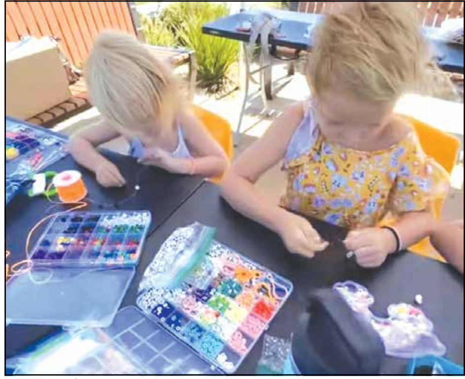
Arts and crafts was a big draw at the event.

Next week, the Park Takeover team and kids will be at Rodriguez Park from 9 a.m. to 12 p.m. Monday, Wednesday and Friday. For more information, call the Recreation Department office at 661-746-3303.