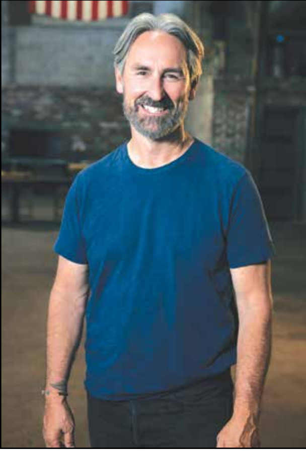
Mike Wolfe is the American Picker and creative force behind the show.

To be considered for the show, send your name, phone number, location and a description of the collection with photos to americanpickers@cinetflix.com or call 646-493-2184. The pickers do not pick stores, flea markets, malls, auctions, businesses, museums or anything open to the public.