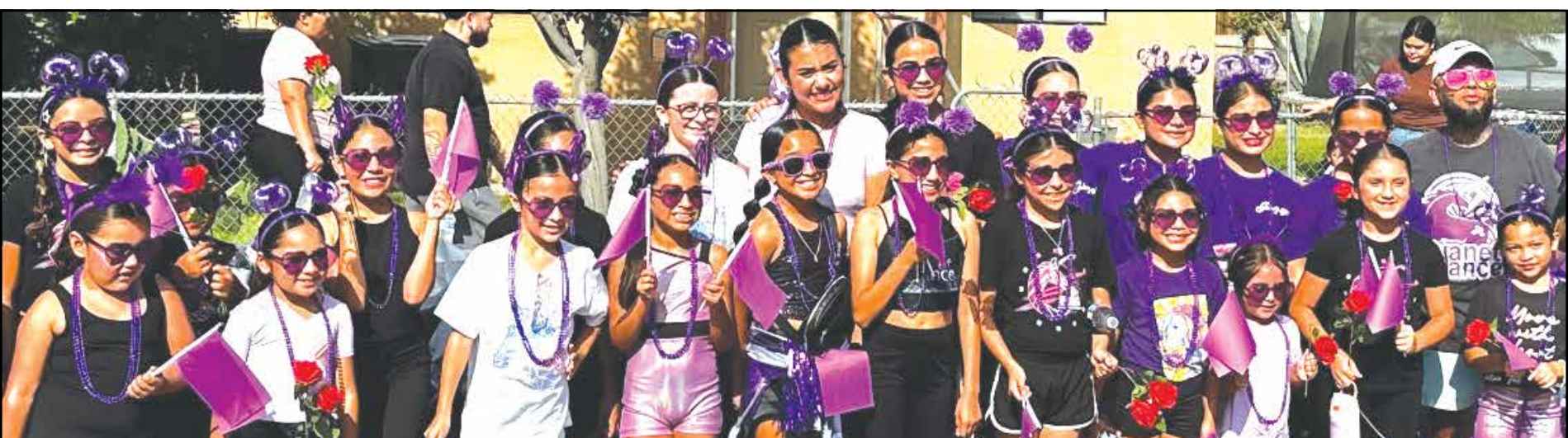
Planet Dance Studio dancers represented their studio in this year's Rose Festival Parade.