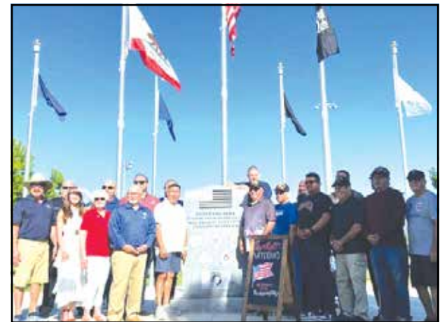
The rededication celebrated veterans and their service.