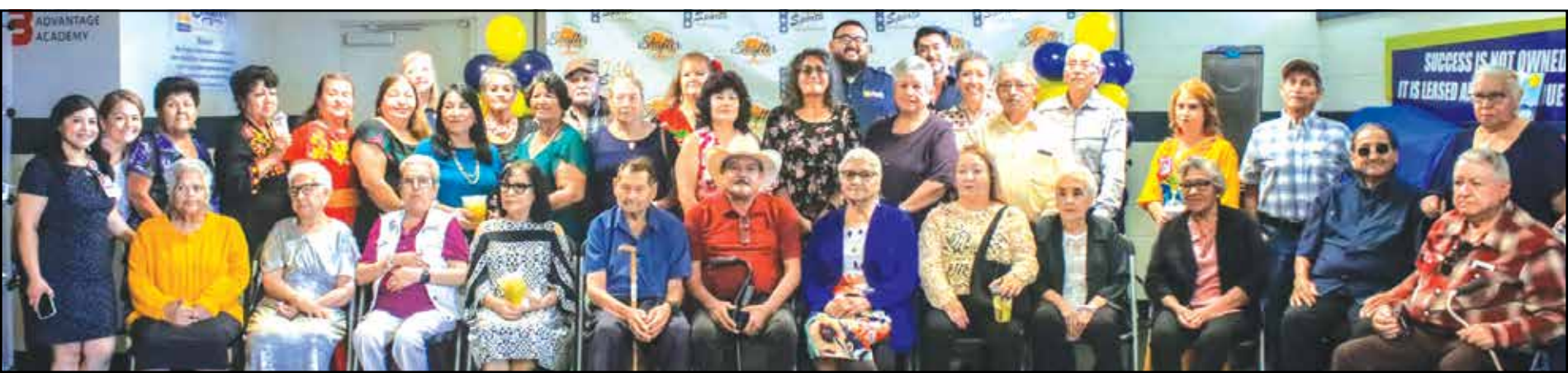
Dignity Health, alongside the Shafter Recreation Department, with a few participating seniors.