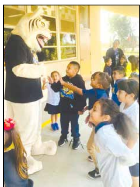
Students gather in their uniforms to meet Woody the Wildcat.

Donations are being accepted at the school, 25300 Hwy 46. For more information, call 661-758-6412.