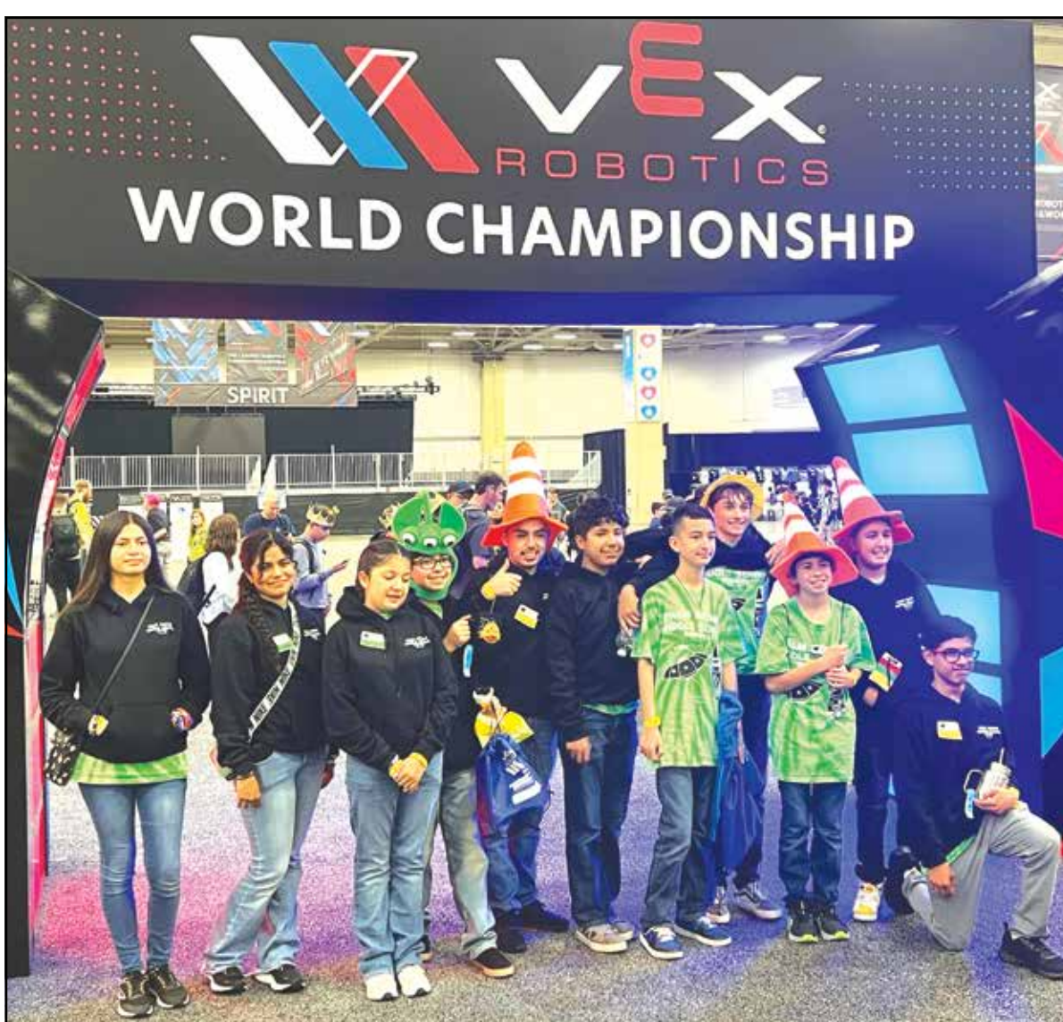
Robotics students thank Google for the grant they received, which allowed them to attend a local competition.