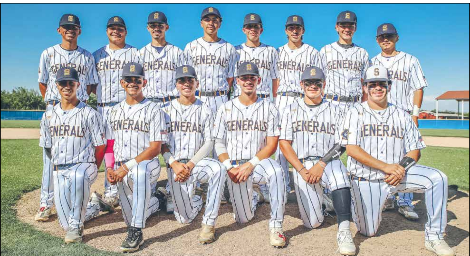
The Shafter High varsity baseball team.