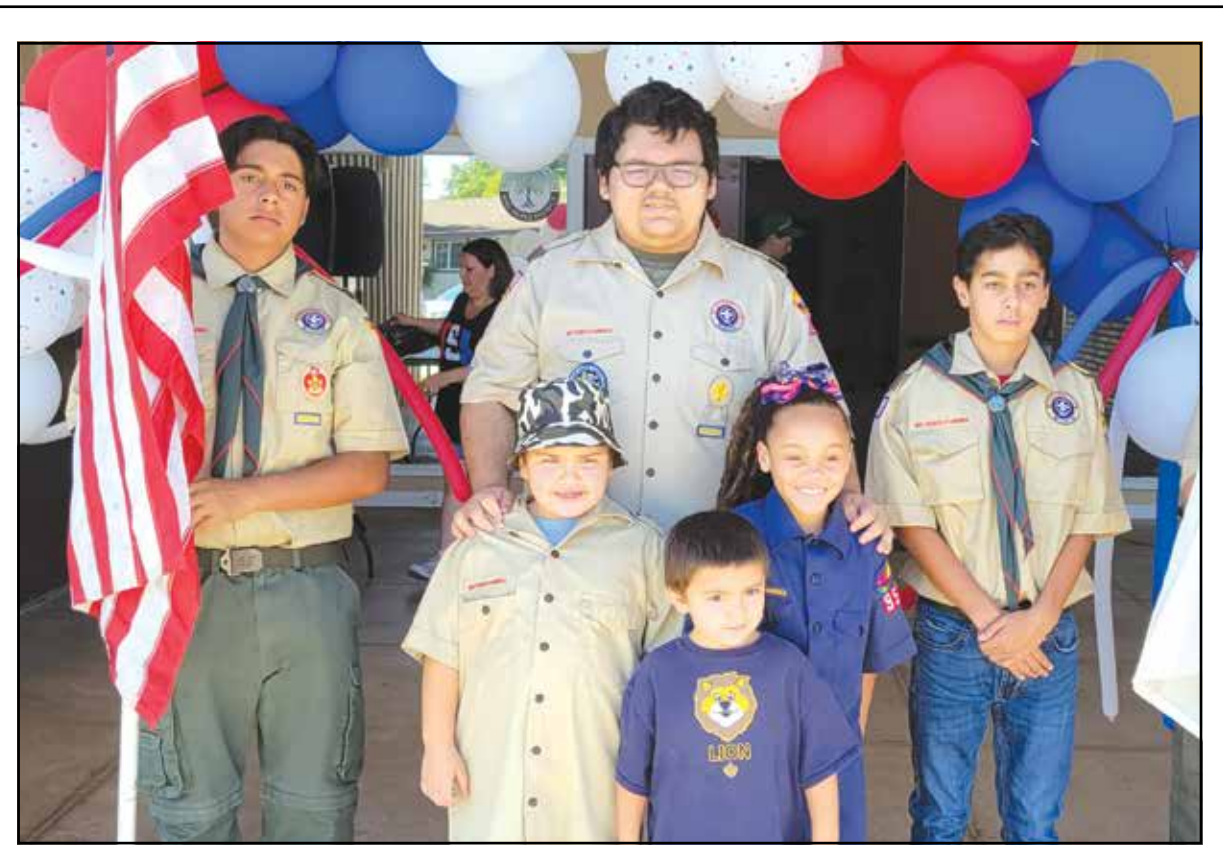
The Boy Scouts will lead a flag ceremony to salute the flag's presence as a sign of respect to our nation and those within it.