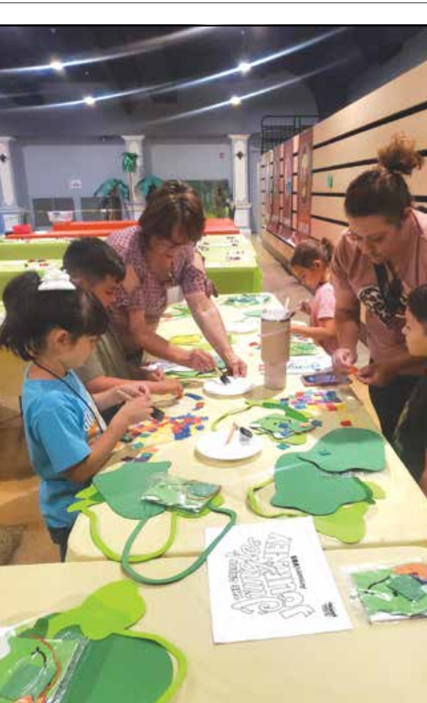
Music was a big draw for the event. MIDDLE: There was choreography to the music as well. RIGHT: Arts and crafts were a part of the VBS.