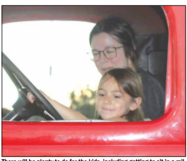
There will be plenty to do for the kids, including getting to sit in a military-style vehicle from Minter Field Air Museum.

The event draws people from all over Kern County, with one of the only fireworks shows in the county, and also holding it on the third, instead of the fourth. This came about years ago when the city was able to secure the world famous fireworks giant Zambelli Fireworks to do their show. This was when the company was also doing the big See SHAFTER Page 6