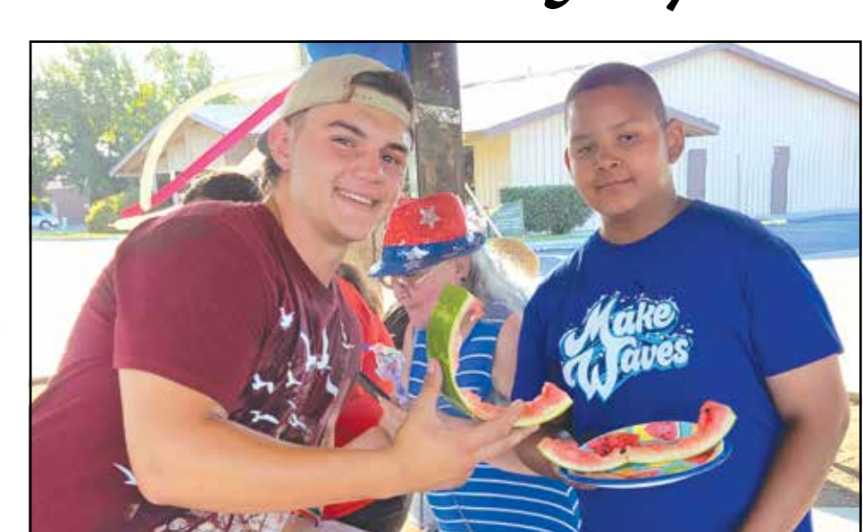
Participants at last year's event compete for a chance to be crowned the Watermelon Eating Champion of the festival.

City of Wasco Animal Control will hold a free adoption event at Barker Park from 10 a.m. to 2 p.m. on the same day.