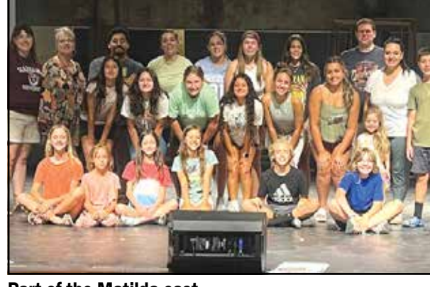
Part of the Matilda cast.