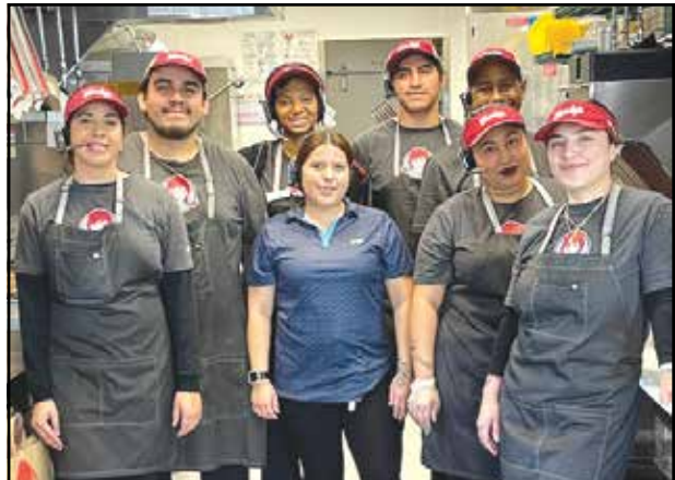
The Wasco Wendy's team is ready to greet customers.