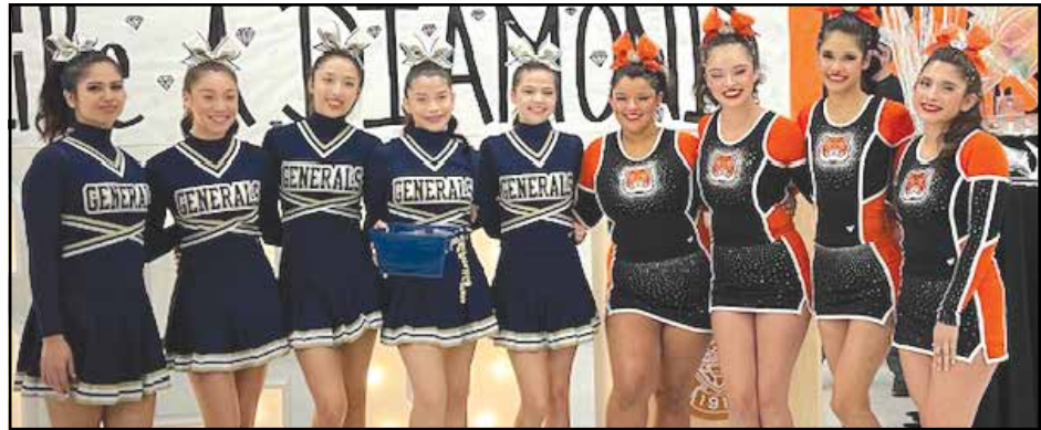
Shafter and Wasco High cheerleaders come together at breakfast at Wasco High, building connections and enjoying each other's company.