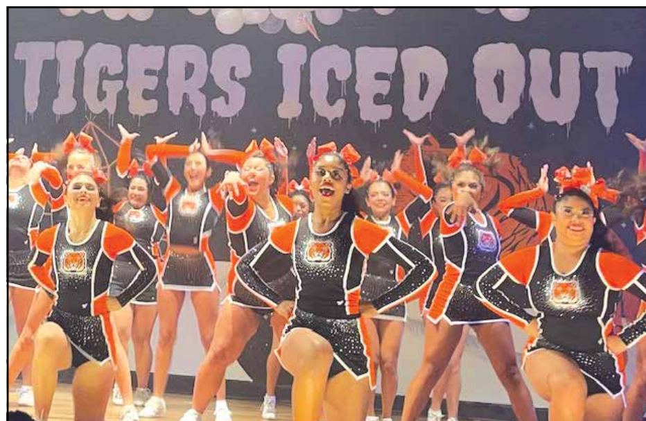
Wasco High School cheerleaders performed a dance routine that invigorated the students at the Wasco rally.