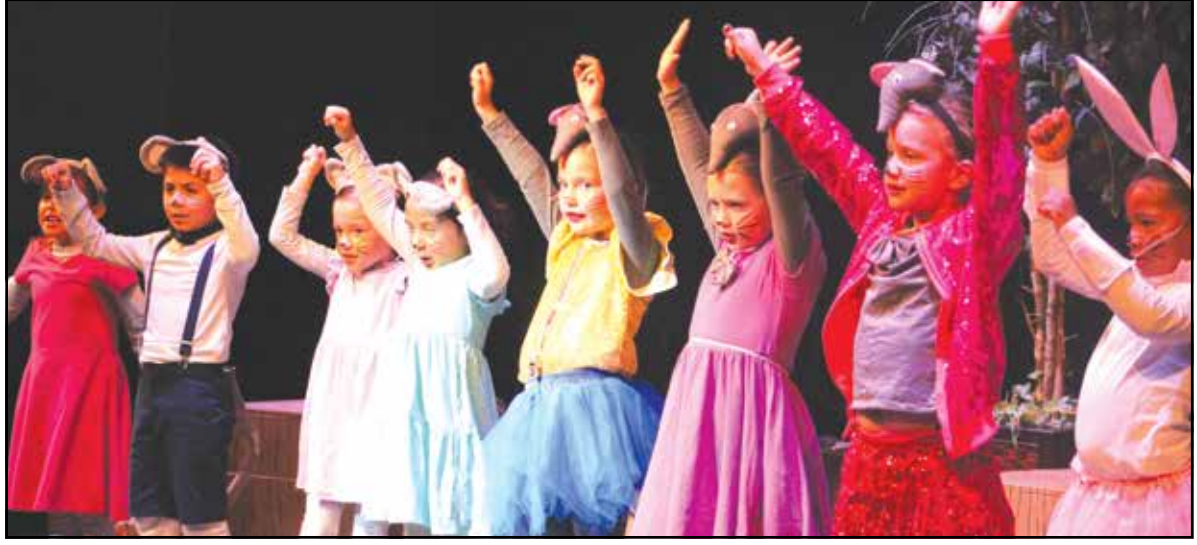
The Rising Stars were up to their name at the performance.