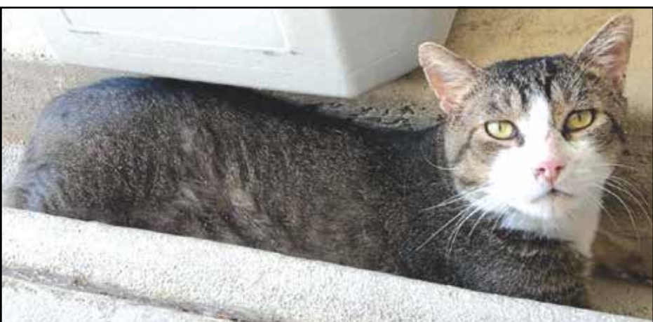
Newbie is still up for adoption.