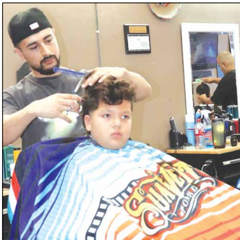
A young boy gets a fresh start with a free haircut at last year's back-to-school event.

Those interested in contributing can drop off donations at the bar-