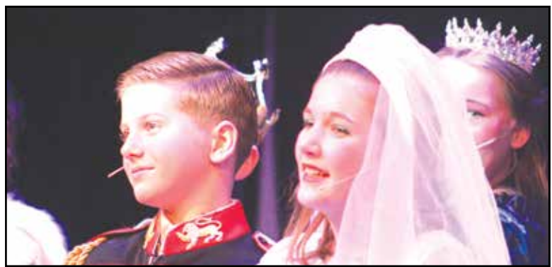
The Prince and Cinderella.

The show began with a performance by the Rising Stars, a group of younger kids who are cutting their teeth in theater, working to be sea-