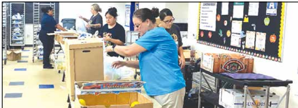
Staff busy organizing healthy fruits and veggies for distribution.

He measured the program's success by the weekly return of participants. "We set a goal of 500 and were unsure if we would reach it, but we met that need each week they came out."