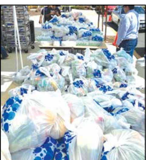
Packed bags of food for fueling fun and learning all summer long.

He said the most rewarding aspect is "feeding the most vulnerable among us. They can't make money for themselves, so being able to serve them with food is a joy."