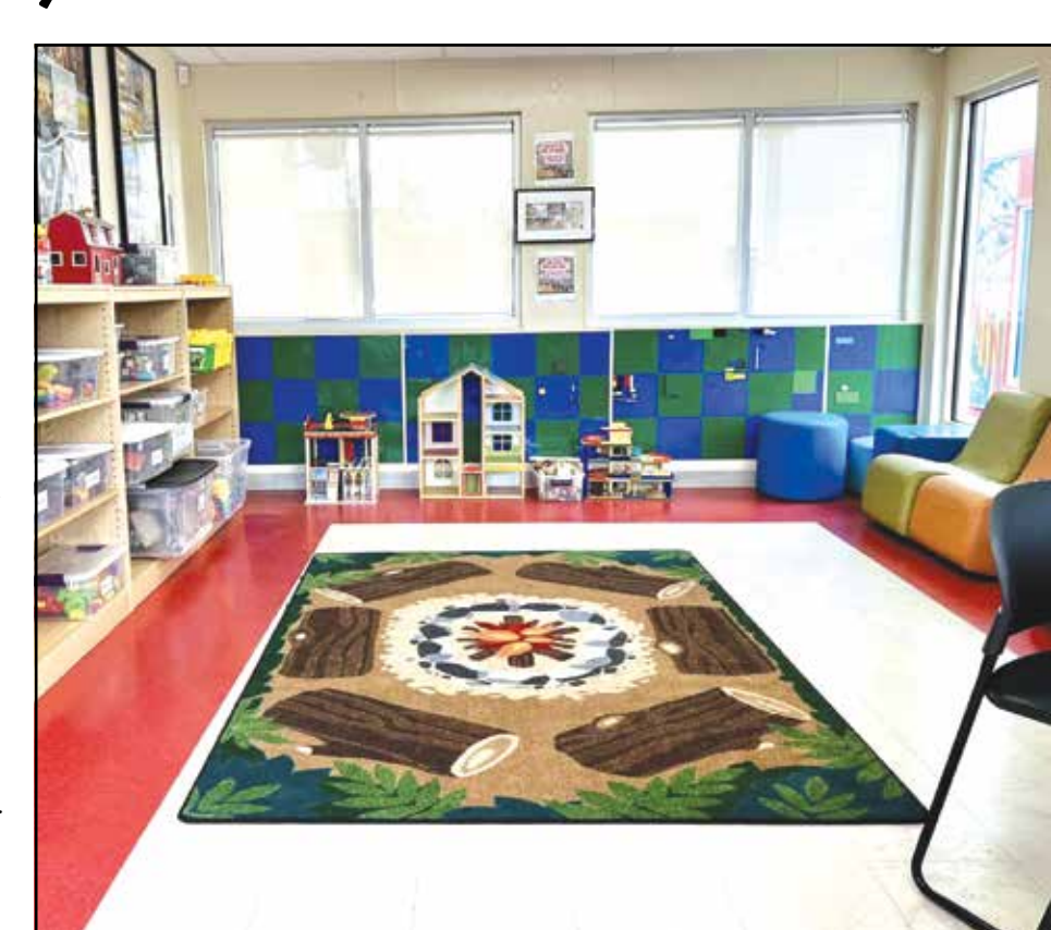
Members drop by regularly to check on the inventory to see if anything is broken or missing pieces and needs to be replaced.