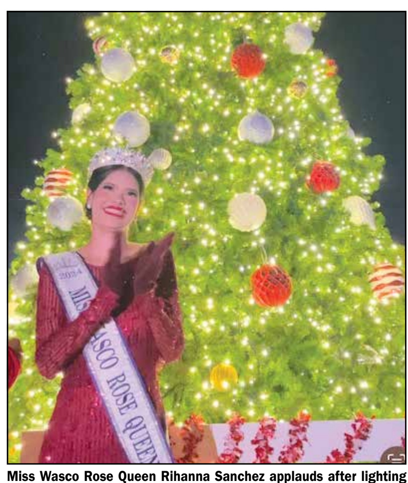
the Christmas tree.

Hundreds of spectators lined the streets of downtown to watch the parade after kicking off the festivities by shopping, eating and