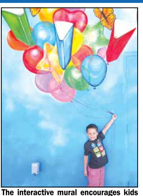
of all ages to bring art to life.