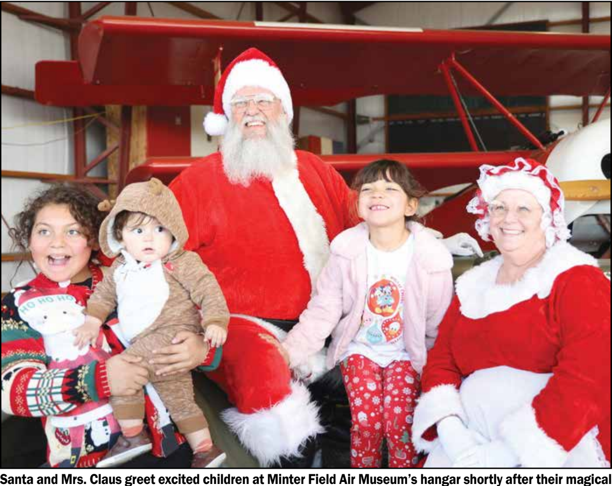
arrival from the North Pole.