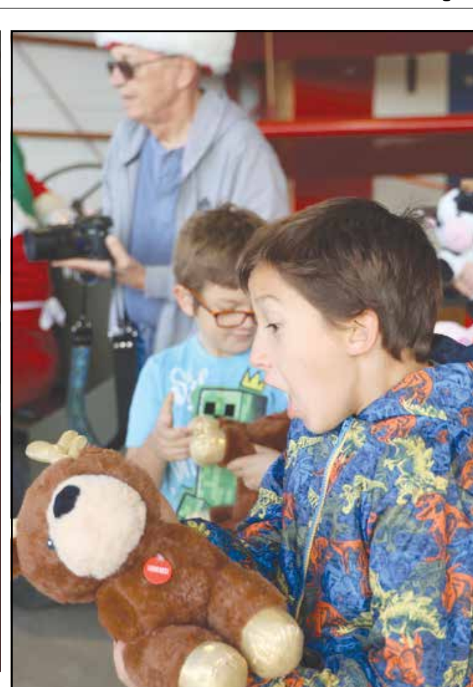
A little boy is overjoyed with enthusiasm as he receives his toy.