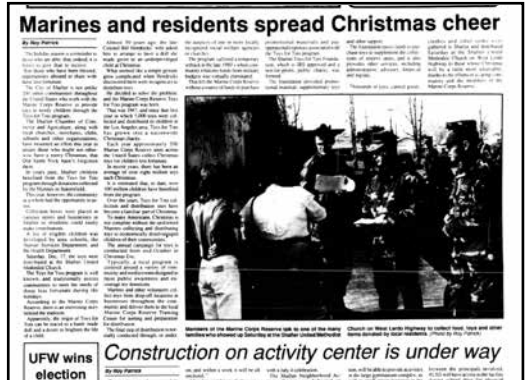
The front page, Dec. 21, 1994