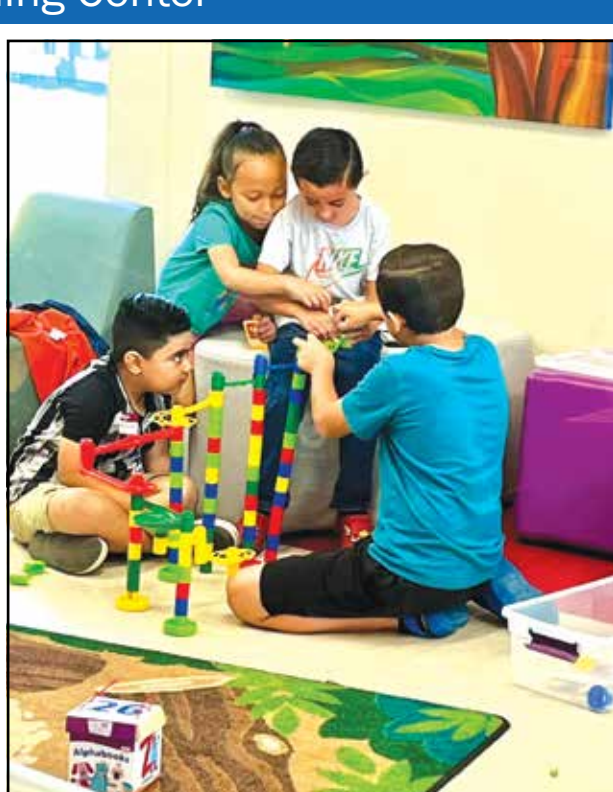
The Friends purchased the toys and games in the Imagination Room.