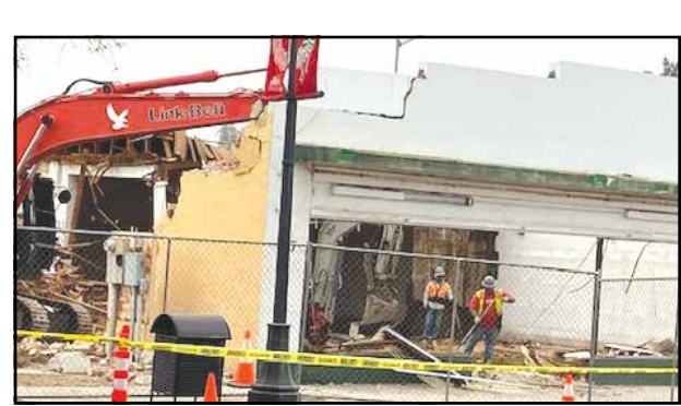
Two workers assist in demolishing the building at Highway 43 and Central Avenue which last housed the Super Discount Center, a structure with historical significance to Shafter's early days.