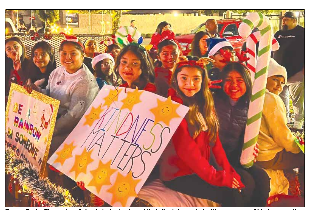
Teresa Burke Elementary School students aboard their float decorated with messages of kindness as they