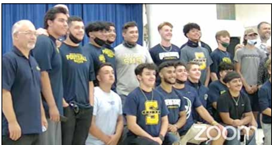
The Shafter High School Varsity Generals football team was honored for their undefeated season.

The responders thought that the area needing most improvement was the employment opportunities and the housing industry. Those responding showed that only 58% were satisfied with the employment outlook in the city, and 62% showed confidence in housing developments in Shafter.