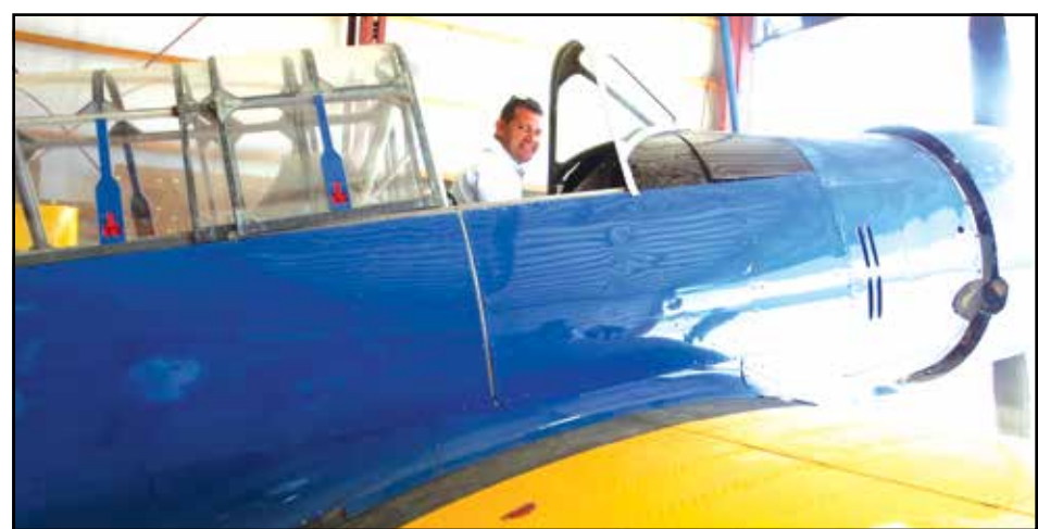
Congressman David Valadao takes a seat in a vintage aircraft at the museum.

From Page 1 and Korean wars, as well as the more recent Middle East conflicts. Valadao also had the chance to sit in a vintage aircraft and the LOACH helicopter, which has been at the museum for the past two years. Valadao discussed the possible opportunities that may be available to help the museum. “We discussed some challenges the museum is facing and how my office may be able to assist,” said Valadao.