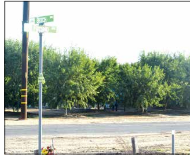
The vehicle crashed near the intersection of Fresno Avenue and Beech Avenue.

Fresno Avenue was closed for several hours to conduct the investigation and clean up the scene. The investigation is ongoing. Anyone with any information on this incident should contact the Shafter Police Department at 661-746-8500.