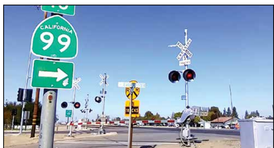
The rail crossing at Lerdo Highway will be closed from today to Friday, May 21 due to maintenance.