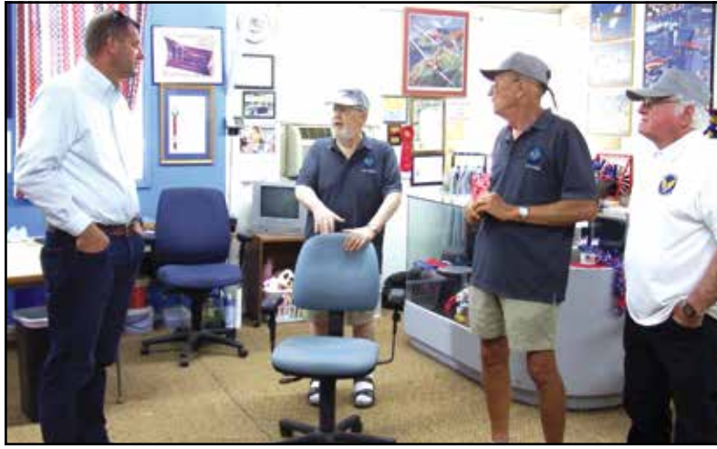
Congressman David Valadao met with members of the Minter Field Air Museum.