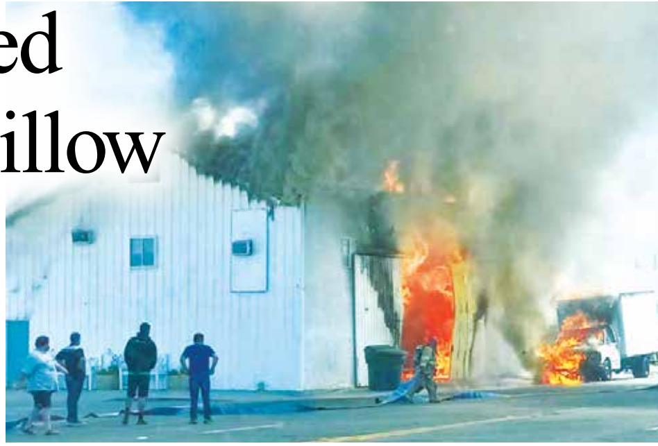
The blaze was upgraded to a two-alarm fire upon arrival.

The cause of the fire and the estimated value loss as a result of the blaze was not available at press time.