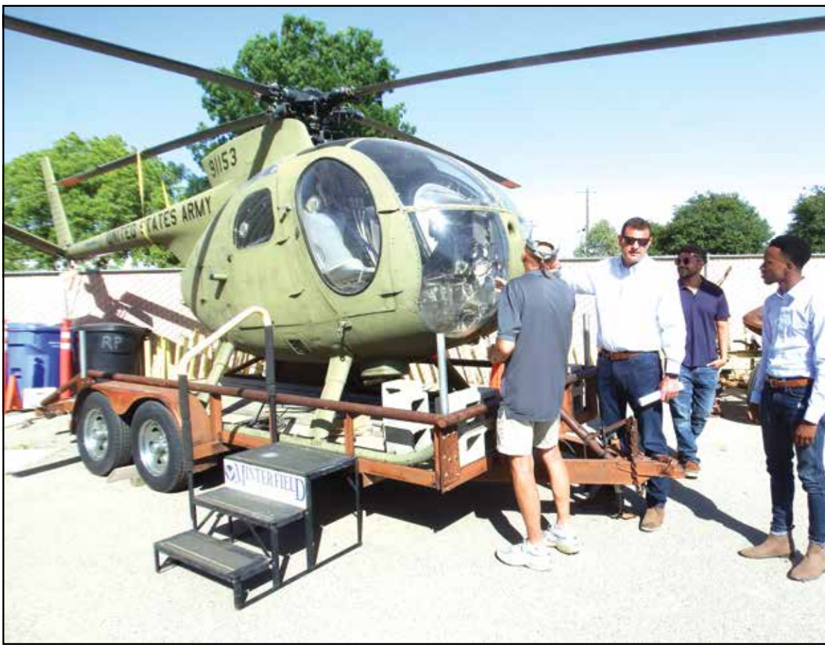
Congressman David Valadao checks out the LOACH helicopter.